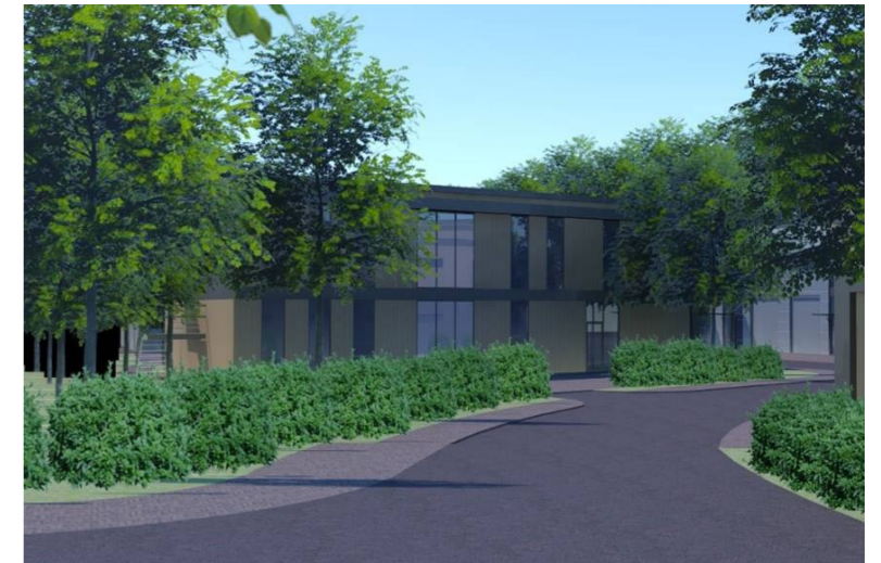
Artist Impression of the Bigginswood site in Folkestone