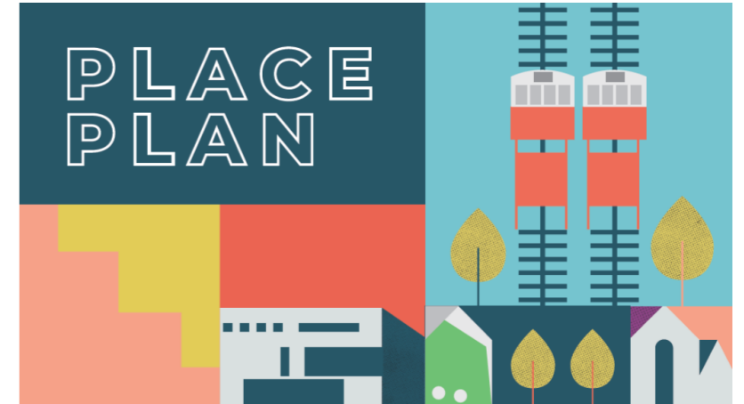
Folkestone Place Plan