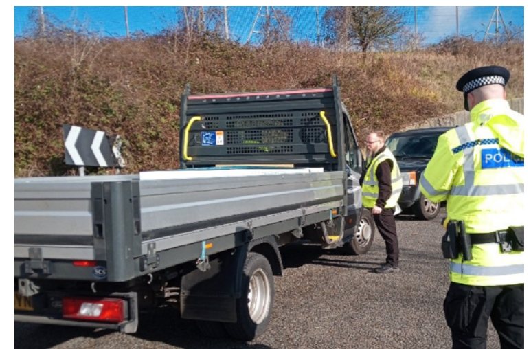
Environmental Enforcement Officers and Kent Police undertaking checks as part of Op Assist