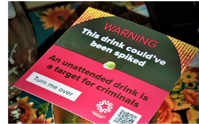
Spiking prevention beer mats distributed to licensed venues to raise awareness of spiking their customers.