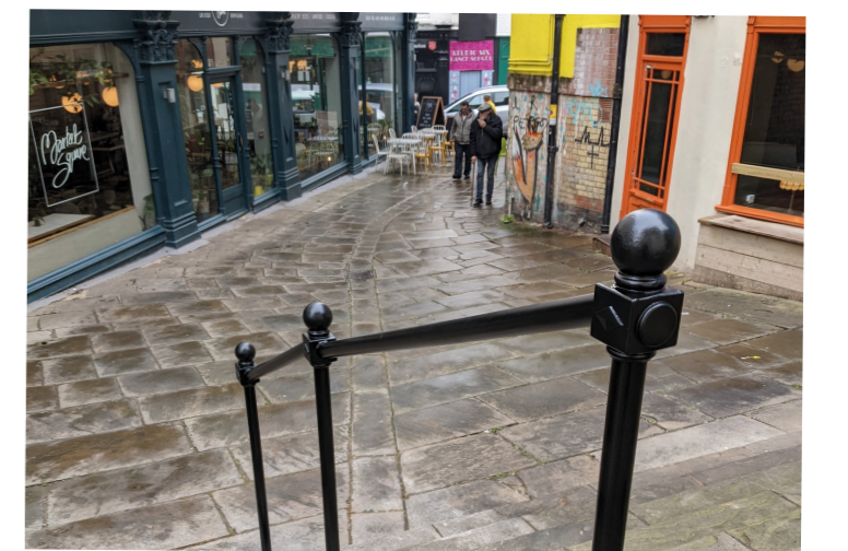
Repointing of the pavement and new handrails installed off Rendezvous Street, Folkestone as part of public realm improvements funded by the 'Welcome Back Fund' during the year.