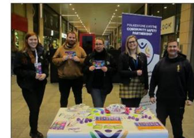
Multi Agency partners hosting a stand in Bouverie Place to raise awareness of violence against women.