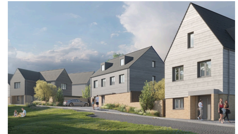
Artist Impression of new low energy homes at the former Highview school site.