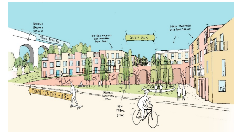
Artist Impression of the Ship Street site.