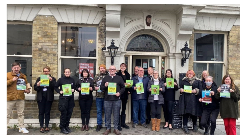
Meeting of the National Pub Watch Scheme in the district with officers from the council's Licensing team and Community Safety Unit