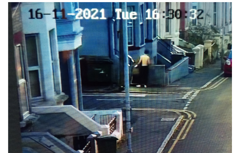
Caught in the Act: Footage of fly tipping taking place