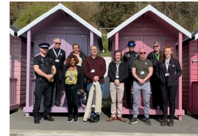
Multi Agency partners attending Operation Sunshine, a monthly meeting to address community safety issues.