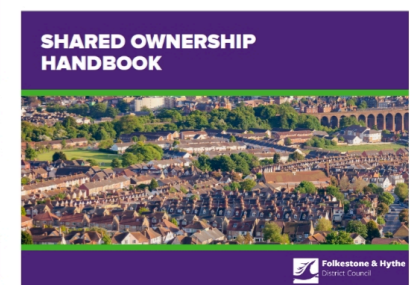
New housing guides introduced during the year to help tenants understand more about their homes.