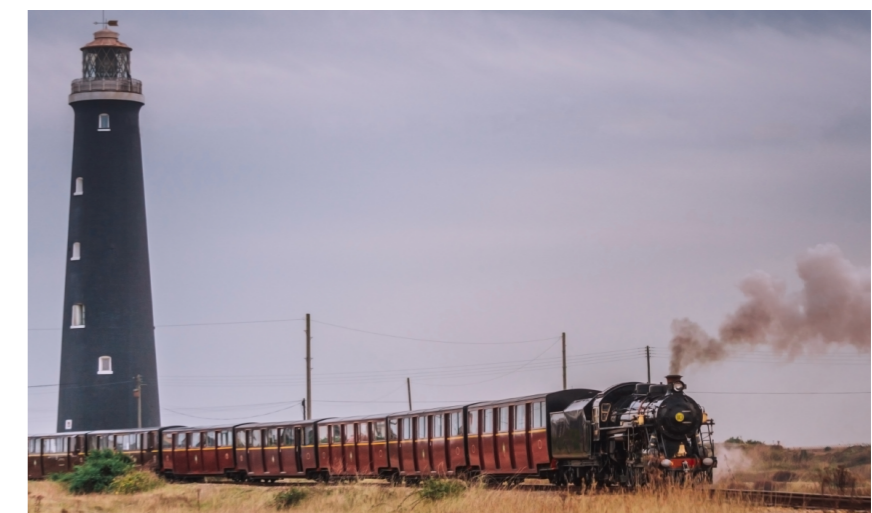
Dungeness, Romney Marsh