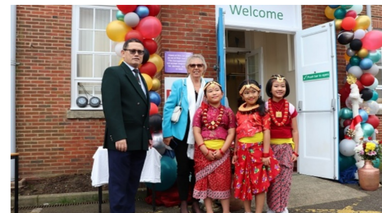
Opening of the new Nepalese Community Centre in Cheriton