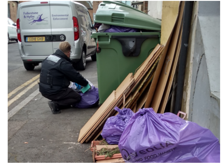
Officer waste search in Charlotte Street